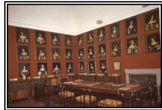
Views of Ariccia and the Chigi Palace