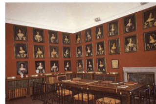
Views of Ariccia and the Chigi Palace